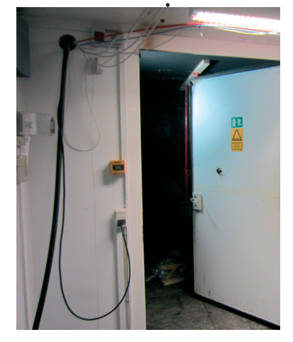
Internal ModuSec room and door suffered no fire damage. New power cable introduced to enable immediate restart.