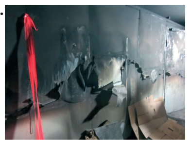
Outer face of ModuSec room