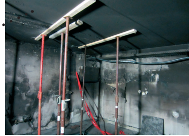
Ceiling collapse in outer room